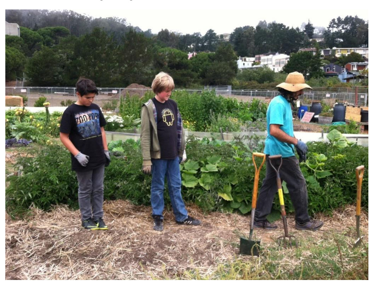
Eco – SF, Day 5_

We were very impressed that they had a whole crop of strawberries on the farm. They also let us taste a few strawberries, and they had grapes for us to munch on at lunch. After that, we visited the chickens and some of us were scared. We chased them and there was a rooster that was hairy named Mr. Miyagi. We walked around the farm several times and every time all of us saw something different. The water temple was amazing to know that lots of people in the bay area's drinking water comes from there. Which is awesome! Then we got on the bus to come home. We all learned a lot at the Organic Agriculture Farm.