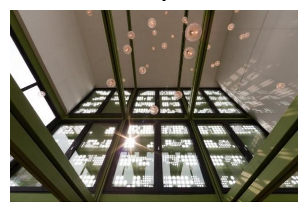
The doors of the containers have been perforated to provide a sun-filtering effect.

Inside, nearly all traces of the original containers are lost as the modular spaces are tied together to form large continuous spaces. The container walls have been reconditioned with thick insulation to prevent the loss of heat, most of which is provided by a geothermal heat pump. Other energy-saving features include a controlled ventilation system, <u>LED lights</u> and locally sourced bamboo for the indoor and outdoor flooring.